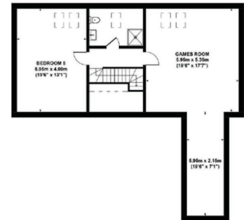
SECOND FLOOR GROSS INTERNAL FLOOR AREA 89 SQ M

WOODCHESTER PARK, KNOTTY GREEN, HP9 2TU APPROX. GROSS INTERNAL FLOOR AREA 436 SQ M / 4693 SQ FT FLOOR PLAN IDENTIFICATION PURPOSES ONLY -NOT TO SCALE